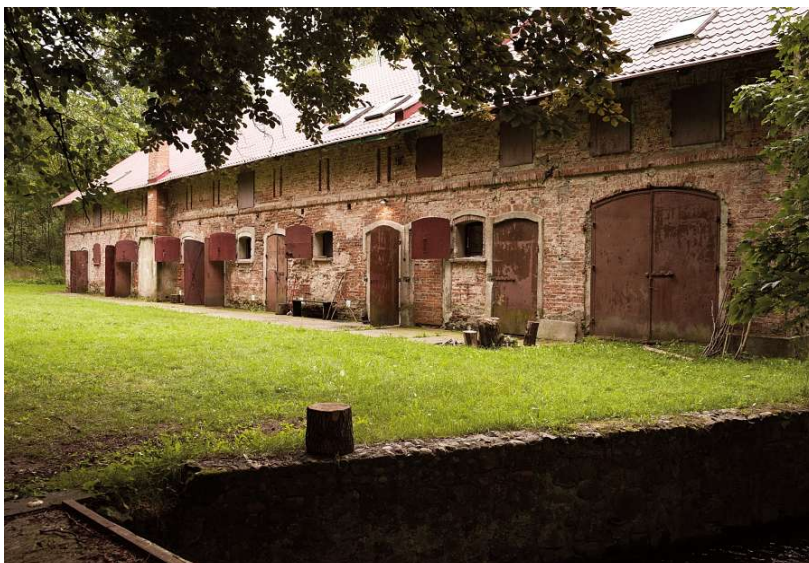
The workspace at Brzezinka.

My first sight of Jerzy Grotowski’s fabled workspace in the Polish woods came by torchlight. It was the summer of 2009, 10 years after the influential and eccentric performance theorist’s death, and I was one of several dozen