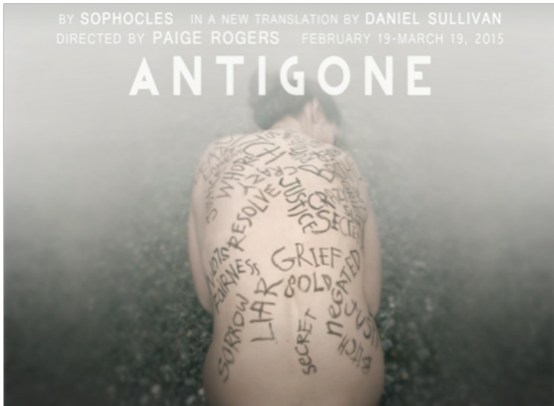
Poster for Antigone.